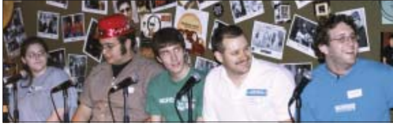
Parties ring in the New Year