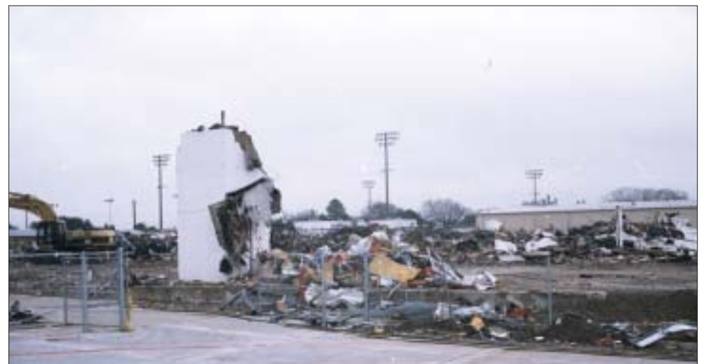
All that remains of MacArthur High School's gym is a pile of rubble and years of memories.