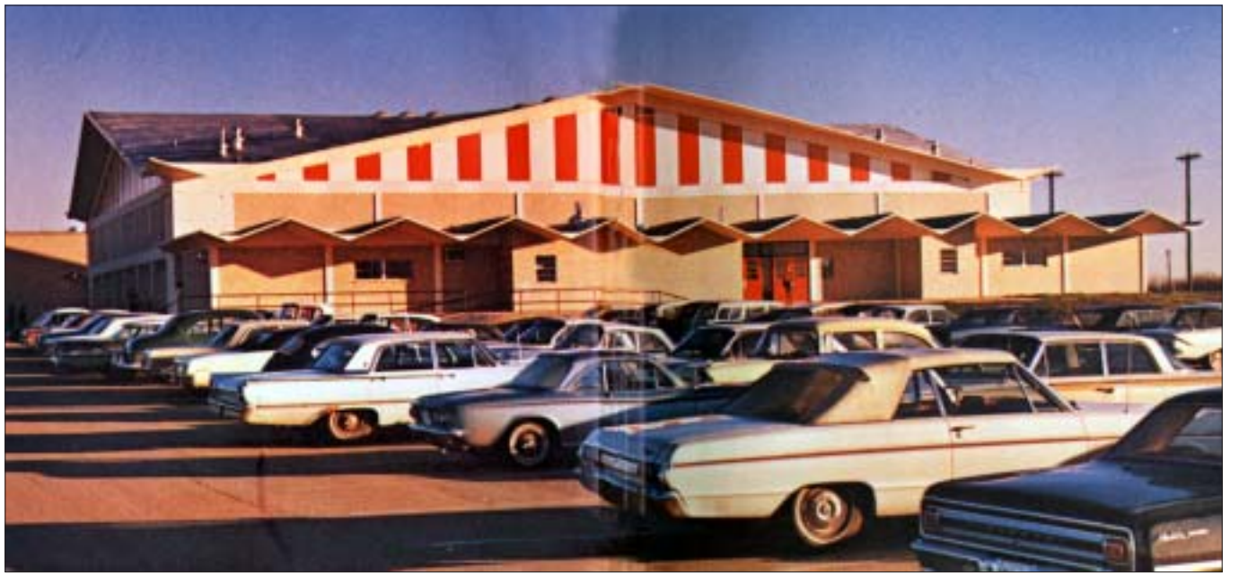
Photo of recently built gymnasium courtesy of the MacArthur High School annual Crest 1968.